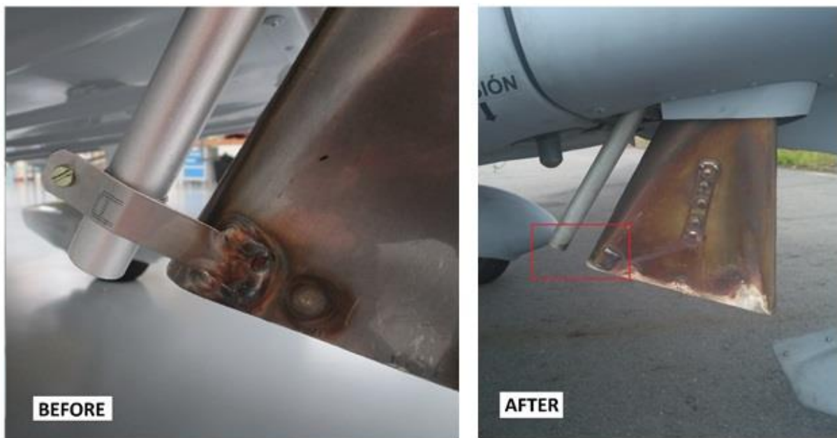
Fig. 1.1 Problem of the broken original Console L242.6674-00.17C

If the plate broke off acc. to Fig. 1-1 (originally welded in Exhaust silencer II assembly – L242.6674H) perform the following correction method: